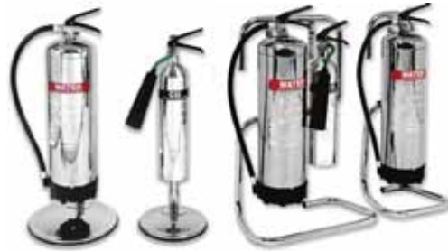
Free Standing Fire Point Stands