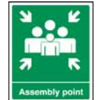
Emergency Escape SRP, PL & SAV