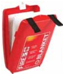
Fire Blanket BS EN 1869 Approved

Suitable for smothering & extinguishing fires