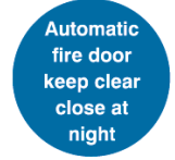
Fire Door Signs SASRP